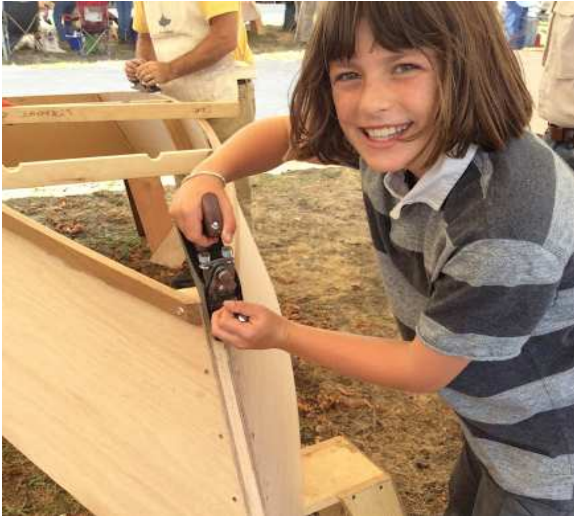
FAMILY BOAT BUILD, July 2016, see “Cover”, pg 3

Inspiring people to build and use low-impact boats