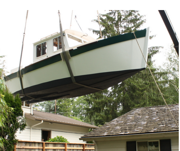
Zakkendrager being lifted over the roof of Ralph's house 7 1/2 years ago