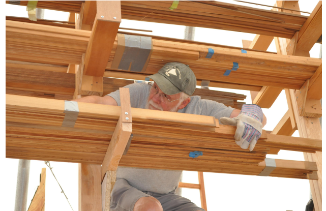
Organizing the wood stored on the mezzanine

The rack is completed and for any member who might be thinking about building a strip built style of boat, there is a great assortment of Western Red Cedar strips available at a huge discount. Some of the strips have already been machined into thin widths with a bead and cove machined on the edges. Anyone interested in these strips should contact Chuck Stuckey who purchased the whole assortment from the estate of the late John Whitehouse. There is also an assortment of other types of planking that was donated over the summer that members can purchase at very low prices.