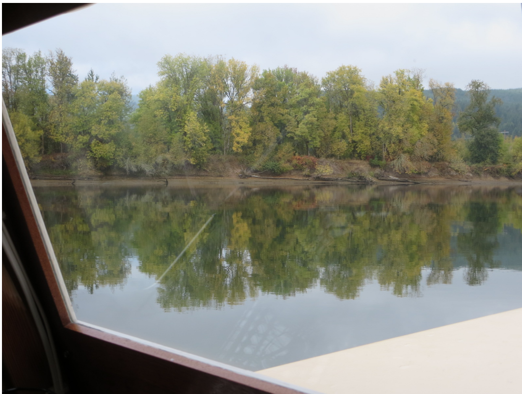
reflections through the cabin window...