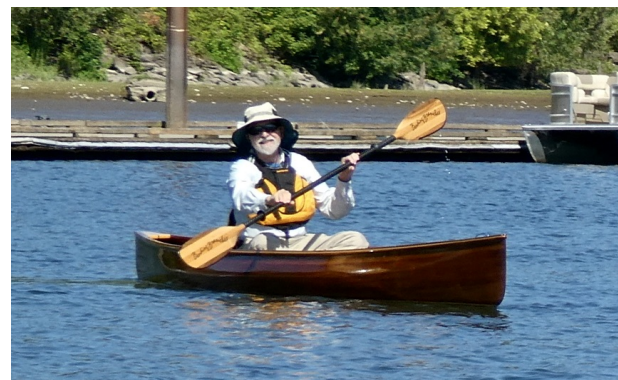
"A double paddle or single paddle is very efficient"

I chose this design as I wanted a smaller, lighter canoe for day trips and lightly burdened camping. I was also drawn to the 'minimalist' ethic of the boat. Building with 3/16" rolling bevel cedar strips allowed a total weight of only 32# even though I opted for full breasthooks with fiberglass reinforcement and a double layer of 4 oz. glass below the waterline.