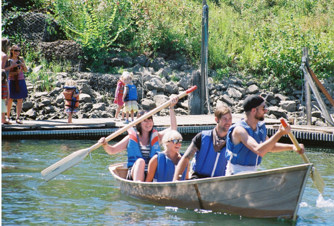
Family Boat Build - 2013