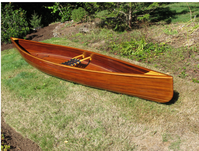
"The boat has everything it needs and nothing it doesn't"

The Solo Day is designed as a fast, light, minimalist single canoe. At 15' OAL and 29" overall beam, 27" waterline beam, its asymmetric hull slips through the water with very little resistance. With the seat mounted at a height of 6-1/2", the boat is easily propelled with either single or double paddles. The narrow beam means that it is very efficient but it does give up a little stability. The stability is more akin to a kayak than most canoes. At 240# displacement, the draft is 3-1/2"