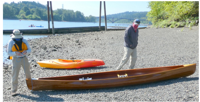
"Long & lean, the Solo Day on the beach"

The plans are complete, clear and accurate and include station patterns. The boat goes together easily. Sanding and finishing of the tumblehome adds some handwork to the construction of the boat but the payoff comes when paddling. The pronounced tumblehome provides ample clearance for the paddler's lower hand.