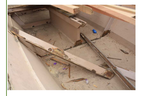
aged by the wake of a wakeboarding boat. The bottom came

Two years ago the Hall Templeton was severely dam-